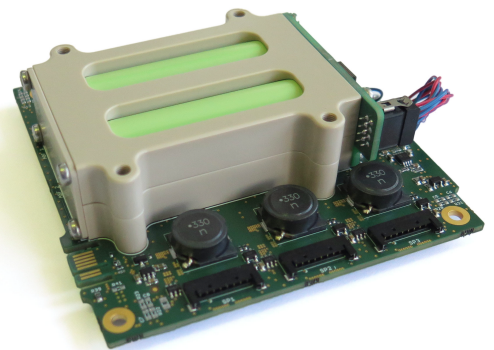
ISIS EPS Type A