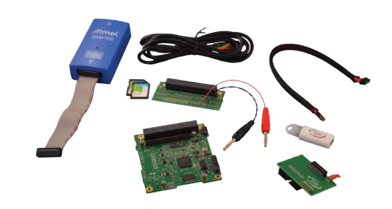
iOBC product contents