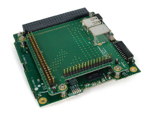
EM Daughter Board