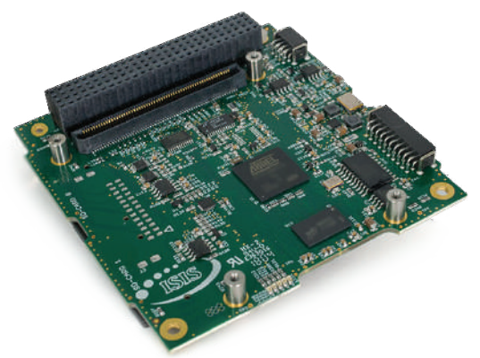
SD card slots