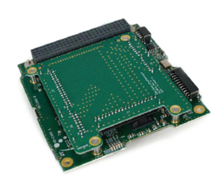
FM Daughter Board