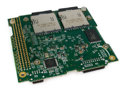
SD card slots